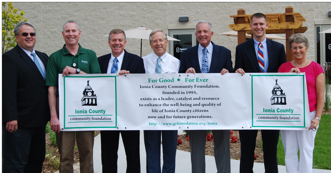
ICCF contributed $50,000 to help build the Sparrow Ionia Hospital.

First six grants were awarded totaling $3,000. In 2020, the cumulative total of grants has reached nearly $1,000,000. When the many component