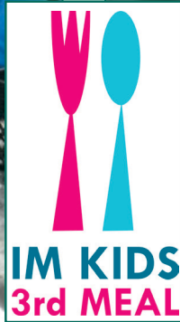
A $3,500 grant was awarded to the Ionia County Intermediate School District in support of the very successful IM Kids 3rd Meal Program which provides nutritious, kid-friendly meals to alleviate hunger among insecure students when they are not in school. Pictured are volunteers preparing evening meals that are sent home with 500 children five days a week.